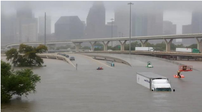
Flooding from Hurricane Harvey, 2017

A tropical disturbance can generate torrential rains, which often have more devastating consequences (floods, landslides, and mudslides) compared to the damage from high winds. Unlike the wind, the intensity of rainfall is not linked to the intensity of the disturbance. Relatively weak tropical low-pressure systems (e.g., tropical depressions) can result in heavier rains than mature cyclones. Even for systems of similar intensity, rainfall can vary a lot from one cyclone to another.